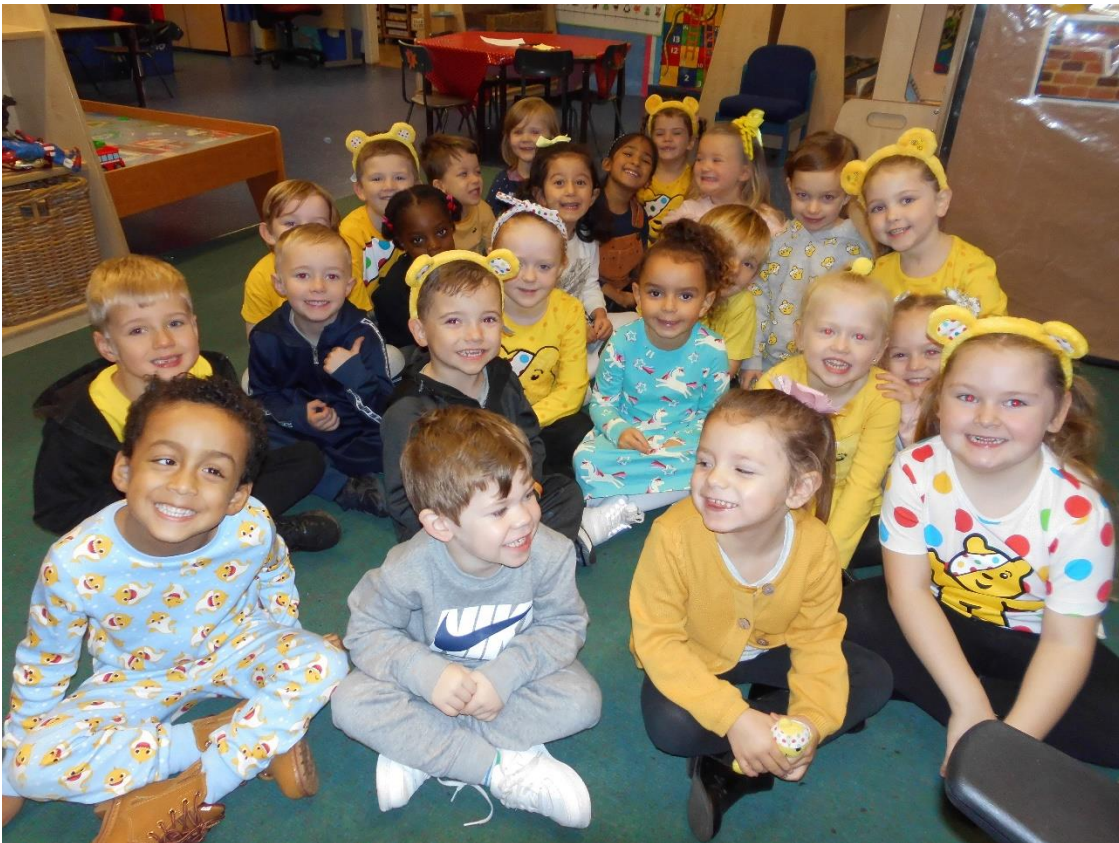
Helping other children makes us happy!