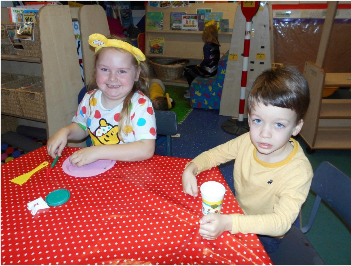
Making cakes for Pudsey!